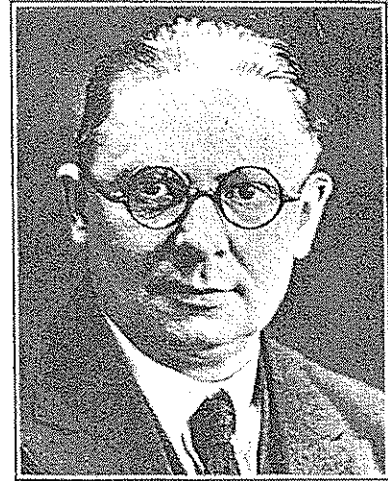
William D. MacCormack Main Street, Central Village (Moosup), Conn.